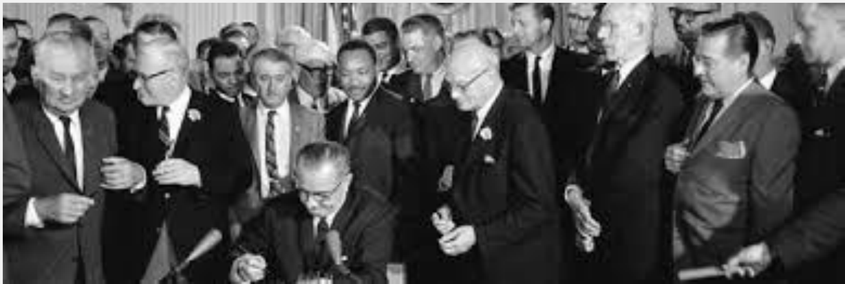
LBJ signs the Civil Rights Act of 1964. Title X created the Community Relations Service.

through the prism of a small, unique federal agency dedicated to the resolution of community conflict. The original idea for the Community Relations Service (CRS) came from then-Senator Lyndon B. Johnson. As president, he ensured its creation as Title X of the Civil Rights Act of 1964. Johnson believed the agency could play a vital role in easing the potentially explosive tensions of desegregating public accommodations, schools and workplaces.