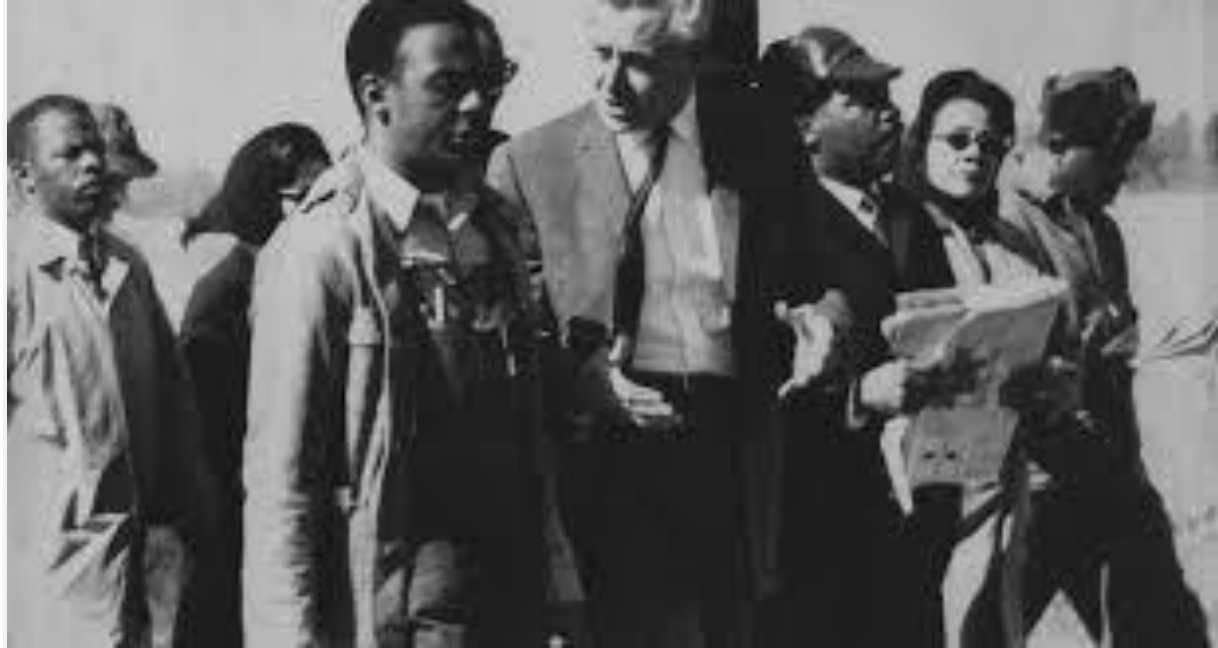
CRS Director Leroy Collins with Andrew Young and Dr. Martin Luther King, Jr. , Selma to Montgomery March, 1965. John Lewis is at far left; Coretta Scott King and Ralph Abernathy at right.

As civil rights history , the book provides a new angle of vision on critical episodes, notably the stories of Bloody Sunday in Selma and its aftermath and the passage of the 1964 Civil Rights Act. CRS's work often focused on the flashpoints of desegregation struggles in the South, but also encompassed conflicts through the U.S. — from urban rebellions in the north, to the armed stand-off at Wounded Knee, to the Boston's school desegregation case and later, the emergence of hate crimes against immigrants and gay people, and the 2012 murder of Trayvon Martin.